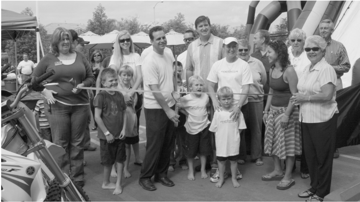
Friends, Family, Customers and City Officials all gathered for the Ceremonious Ribbon Cutting!