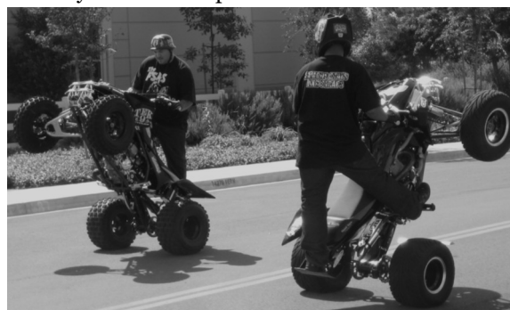
C $tack and Hitman doing synchronized stunts.

Visit us at purelyinnovative.com and innmotorsports.com to see more pictures