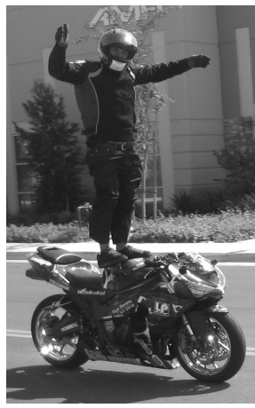
EDub shows the crowd how easy it is to rise up.