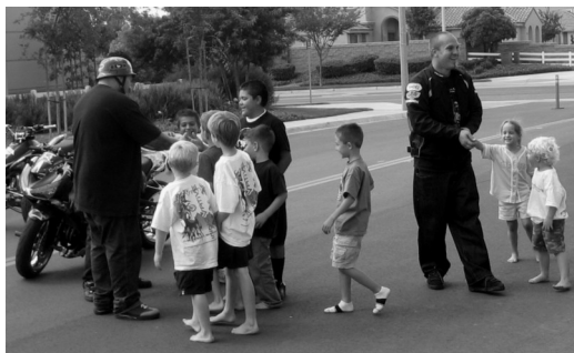
The kids flock to the riders after the show.