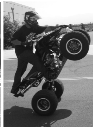
Hitman doesn't need all 4 tires to ride this quad!