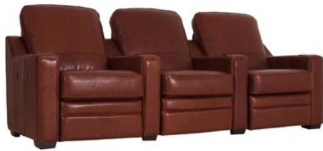
R&R Home Theater Couch

Robinson and Robinson is a unique furniture store in the fact that it offers everything custom.