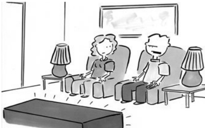
"I've tried everything! Surround sound, hi def TV, DVD and this movie still stinks!"