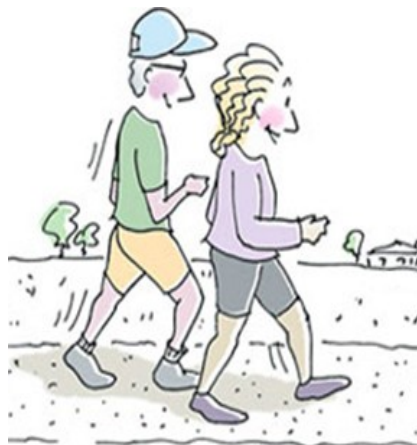
"It's a deal - two more years, then we let ourselves go."