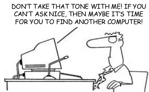
The problem with Voice Recognition Technology