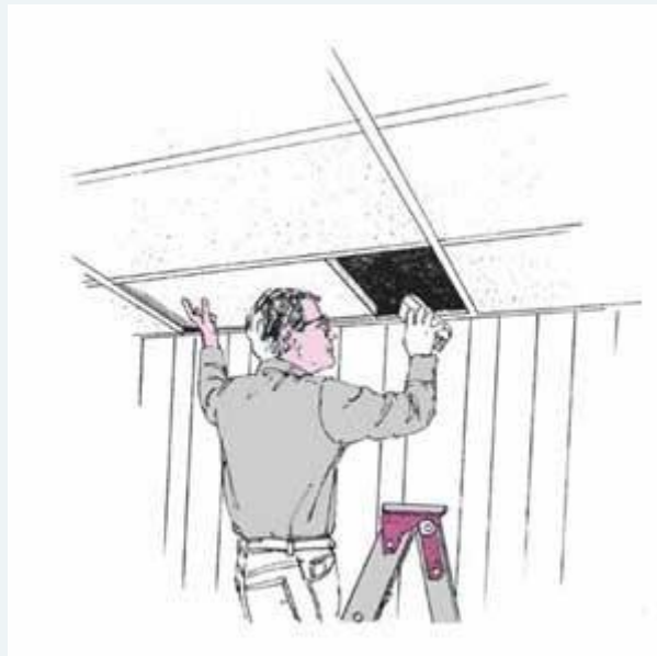
Devise a hiding place for valuables in an acoustical ceiling.

Devise a hiding place in an acoustical ceiling. Remove a tile and restore it afterward with magnetic fasteners or a similar device. Be careful not to leave finger marks.